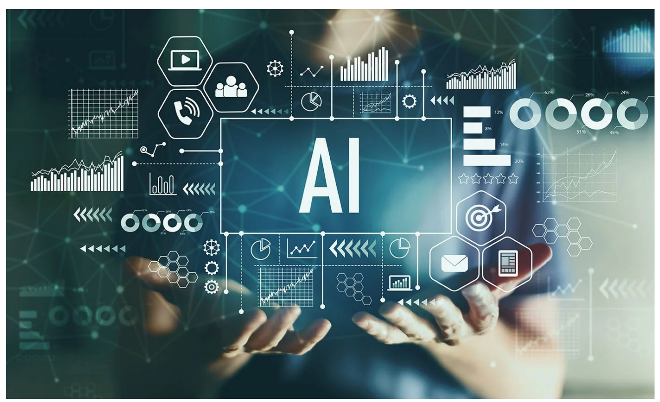
AI in Libraries and Education, Tierney