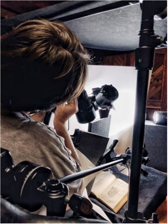
Alkek Digitization Lab

The University Libraries' suite of online open-source research tools can help researchers from all disciplines in empowering their data and research papers. To submit your research by yourself, or find out more about using <u>Dspace (guide)</u>, <u>Dataverse (guide)</u>, or other applications mentioned, please feel free to contact Laura Waugh, Digital Collections Librarian <u>Iwaugh@txstate.edu</u>. Also, visit our <u>Digital Collections</u> or <u>Data</u> <u>Repository</u> online to begin to explore further.