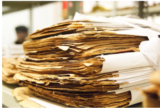
Ancient Manuscripts at Sankore Madrasah, Timbuktu, Mali

While our libraries in North America and Europe are well-known with longstanding histories, there are ‘other’ libraries and library traditions in Africa, Asia and South America. Except for disciplinary experts, these libraries and library systems are mostly unknown to the western world. This episode will explore these dark continents of libraries and treasures nodding to the Gates and other international foundations amazing work with libraries and information technologies in developing nations.