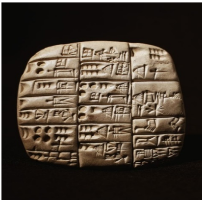
Cuneiform Tablet, Mesopotamia

From here, we will take a deeper dive into the vast realm of the organization of knowledge and history of the catalog. This episode overviews these classificatory schema and their history from the first tablet catalogs to the digitized Mesopotamian tablet library in Princeton looking at the codification of the catalog of human knowledge with Dewey, the Library of Congress, Ranganathan in India, and other heterodox organizational systems, such as Aby Warburg’s unique organization of the Courtauld Art Institute, London.