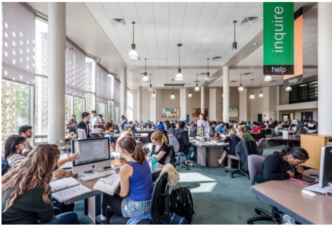
Mills Memorial Library Learning Commons, McMaster University

The current buzzword in libraries is ‘the learning commons’. Like it or not, books are being shipped out and technology en masse is being brought in. What does this current technological sea change for libraries herald? Does it signal the end of libraries? Has the internet taken over the role of the library? Will people now stop reading paper-based media and have the techno barbarians successfully stormed previous monastic gates? This episode will explore our new millennia redefinition of libraries.