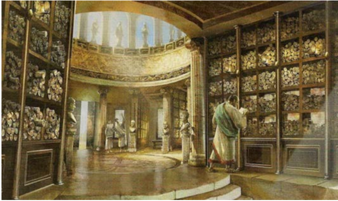
The Great Library of Alexandria: Information and the Scroll

After looking at these modern examples, we would now go back to the present day great library of Alexandria in modern day Egypt. Do traces of the past remain? What are the library's present objectives? How did this library function in the ancient world and what was its purpose with regards to empire and the state? Are there parallels for significance today?