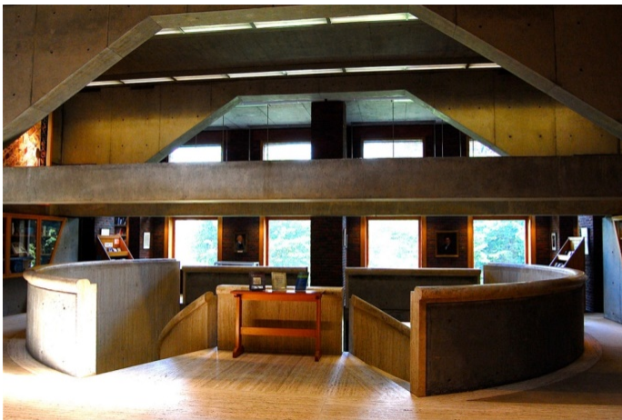
Architect Louis Kahn's Spiritual Masterpiece, Exeter Library

Libraries have always been places of learning, reflection and inspiration. What is the history of 'shhhh!' and where does it come from? Are libraries still quiet places? Let's look at libraries, quiet and noisy, from magisterial monastic origins to more current masterpieces of reflection and inspiration ranging from New York Public's great reading rooms to Louis Kahn's modernist library masterworks at Yale and Exeter in the quest for spirit in library design.