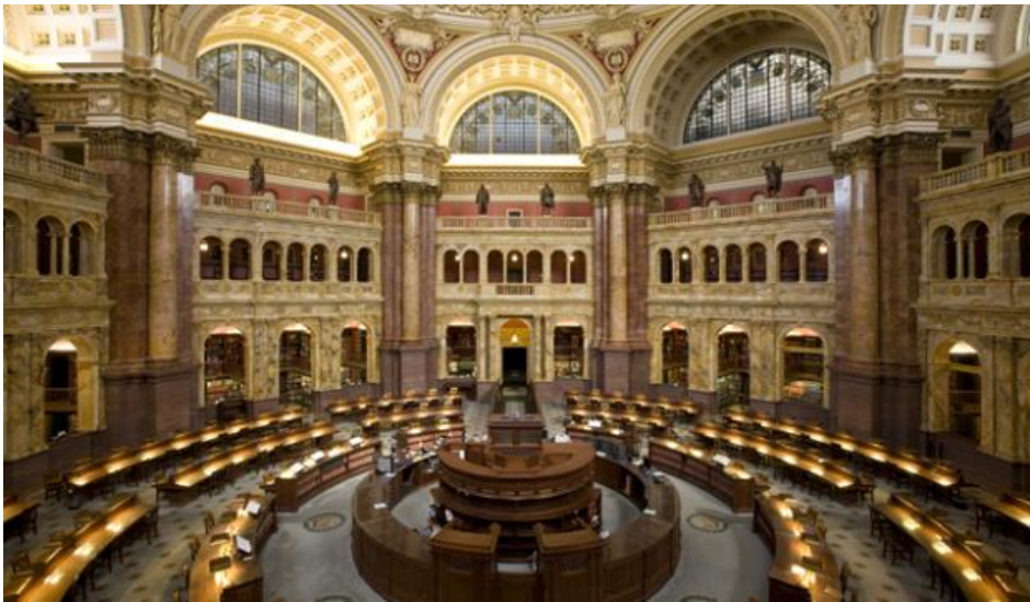
US Library of Congress, Washington D.C. Great Reading Room

Beginning locally, the series would then tour some of the great libraries in the US: the Library of Congress , Harvard's Widener , the New York Public and Andrew Carnegie's decision to fund libraries for the public good in the 19 th century. What were each of these libraries' purposes? How did they develop and what are a few of their treasures?