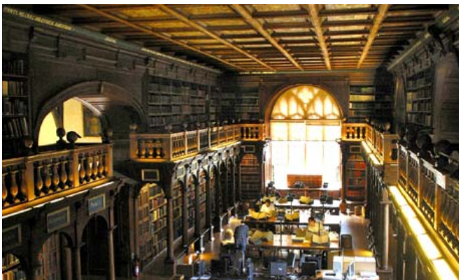
Oxford University's Bodleian Library

From here we would travel to the great libraries of Europe: Oxford, The British Library and the Bibliotheque Nationale in Paris. How did these great university and national libraries begin? What are some of their hidden treasures? Who were the high and low-born patrons? Apparently, Marx spent much of his time in London in the British Library and what about all of the scholars and students around Oxford? What roles did the original libraries play in Europe and how do they serve the patrons, students and general public today?