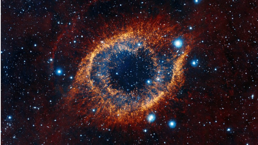
Carl Sagan's Cosmos