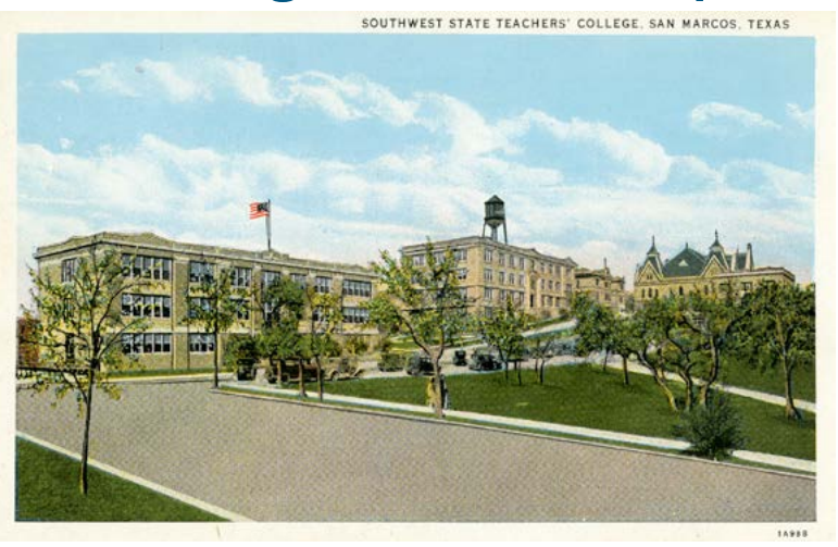
Early postcard of the quad, with the new Education Building on the left

Various agreements between the city of San Marcos and the college allowed for elementary and secondary school students to