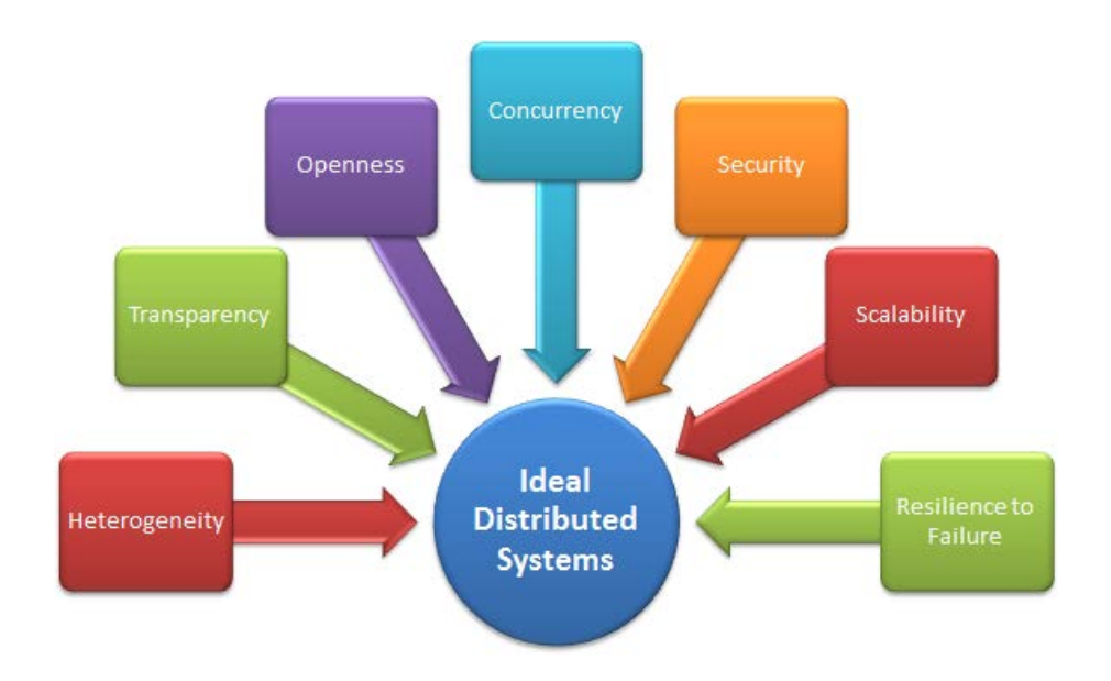
Figure 2: Challenges to Online Libraries as Cloud Based Distributed Systems

Online academic libraries are essentially large and complex distributed information systems. These systems consist of a number of a separate smaller information systems threaded together to create a large synthetic whole. The integrated system will usually comprise a central web infrastructure, either homegrown or managed content management system (CMS), an integrated library online catalog (ILS), connections to multiple specialized subject article, e-journal and e-book databases (at times hundreds) and several information discovery tools that aid in seamlessly tying systems together and providing the end user with a relatively transparent research discovery and retrieval experience.