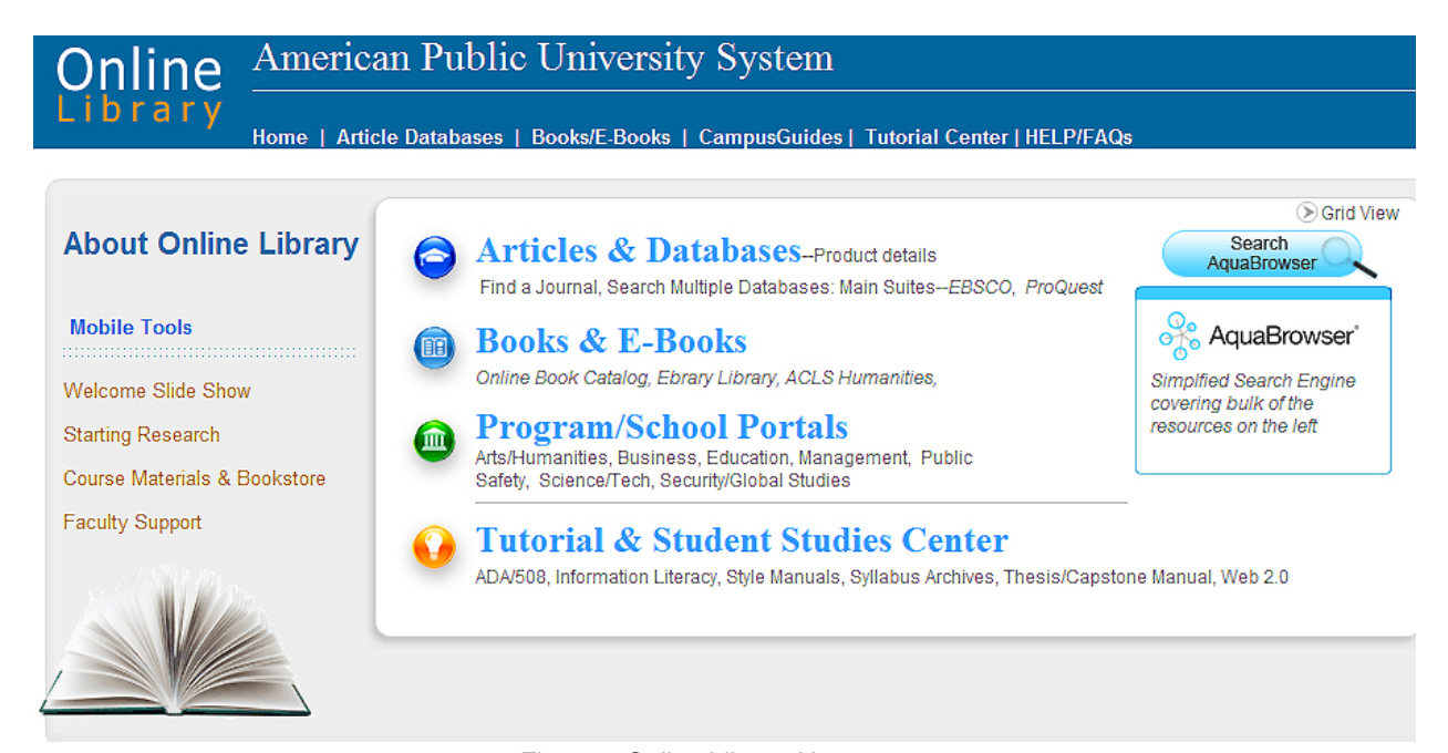
Figure 1 Online Library Homepage