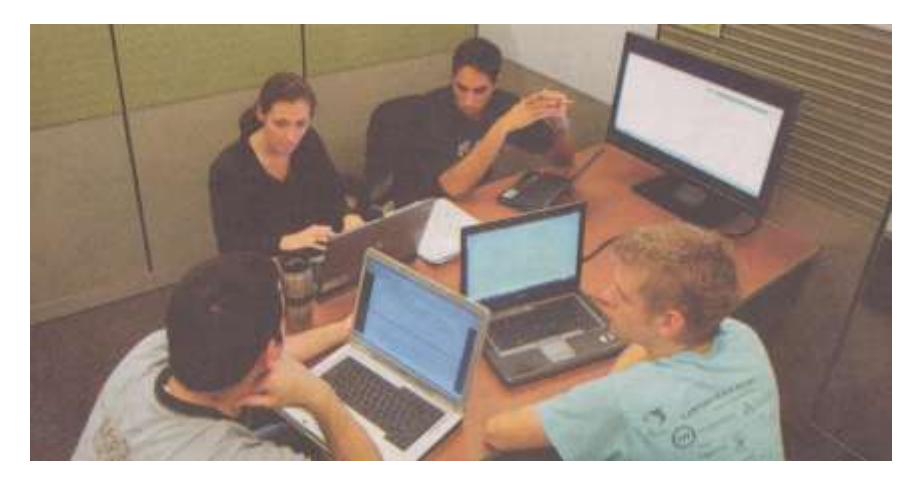
Appendix D Sample LCD Docking Stations and Fifth Floor Classroom